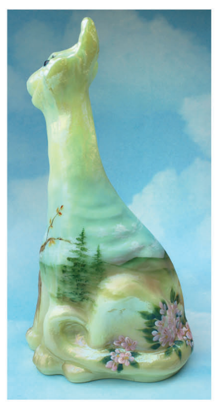
Symbolizes and captures the beauty of our nation's 35th state...widely known as "Almost Heaven."