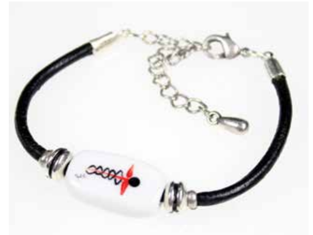
11566 Rx of Care $49.50