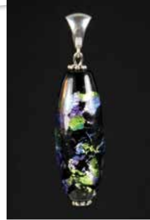
11605 $85.00 Abyss