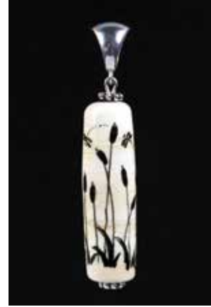
11607 $79.50 Cattails and Dragonflies