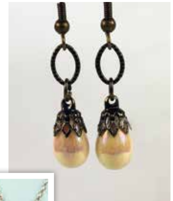
11611 $24.50 Ivory Pearl Earrings

A stunning look. . . our African Violet necklace paired with the lovely Lavender 'n Lilacs gold plated earrings!