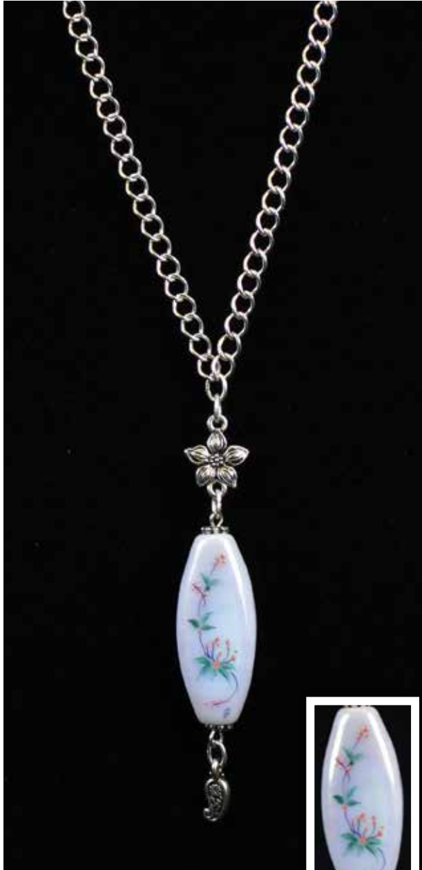
11581 $69.50 Lovely Jasmine Necklace (26")

This beautiful necklace is light and shimmery... lovely for your Spring and Summer fashions. Perfect for layering with any of our other gold plated pendant necklaces. Necklace is 32" and is gold plated brass.