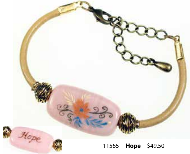
11565 Hope $49.50