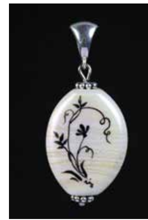
11602 $75.00 Ebony Garden Pendant