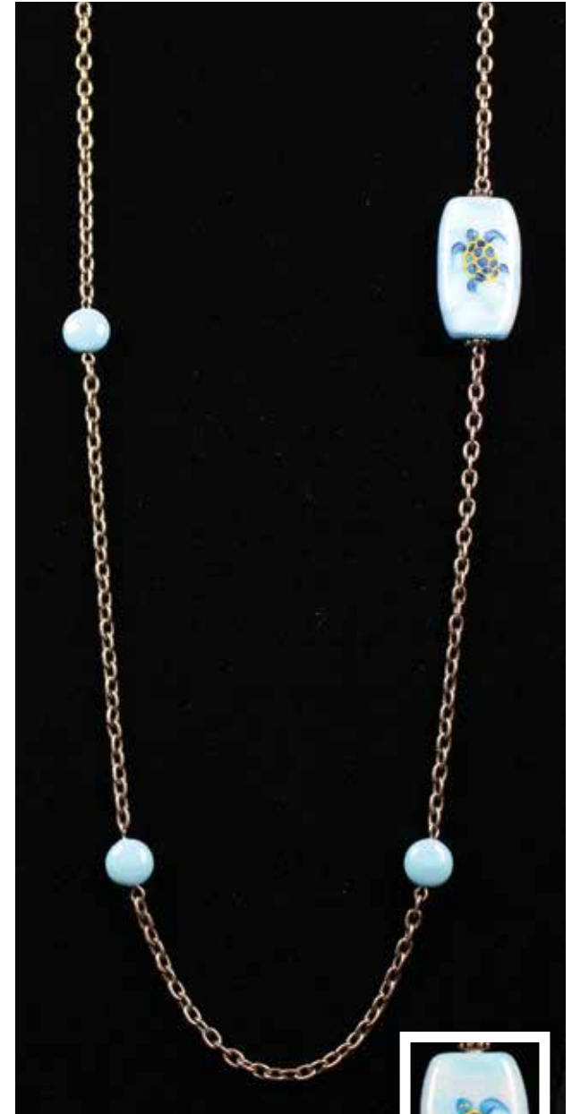
11554 $79.50 Turtles and Turquoise Necklace (33")

A light and shimmery accessory . . . perfect for Spring and Summer styles! This silver plated brass necklace features a curb link and a textured hammered link chain accented with hammered oval and round links. Layer Silver Rings with our other chains to create your own look! Create it, wear it, love it!