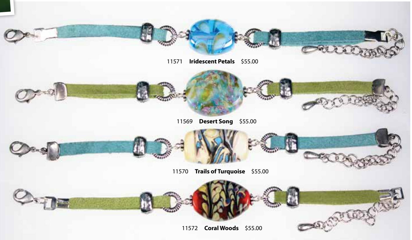
11571 Iridescent Petals $55.00

11572 Coral Woods Suede Bracelet Coral Woods bead has a pulled feather pattern using reactive glass in earth tones.