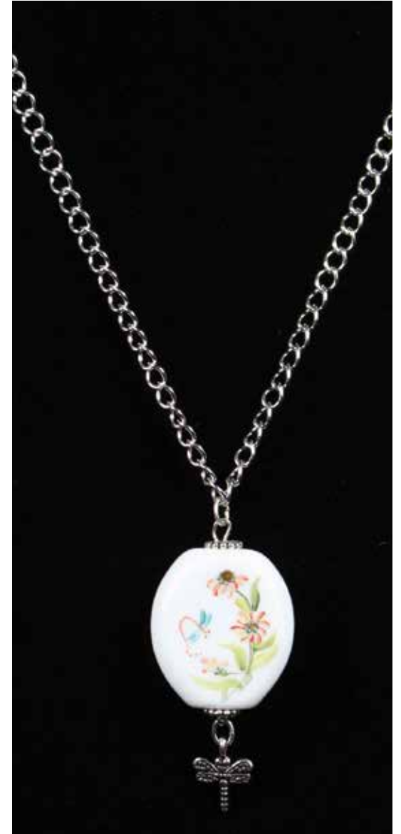
11594 $75.00 Jitterbuggin' Dragonfly Necklace (20")

The 1 1/4" pendant features deep violet transparent glass accented with glass bits in deep purple, green and white. These colors are then swirled to form a beautiful one-of-a-kind pattern for each necklace that is as unique as the lady who wears it. The symbols and colors used in this necklace were also used in Suffragette jewelry of the late 19th and early 20th century.