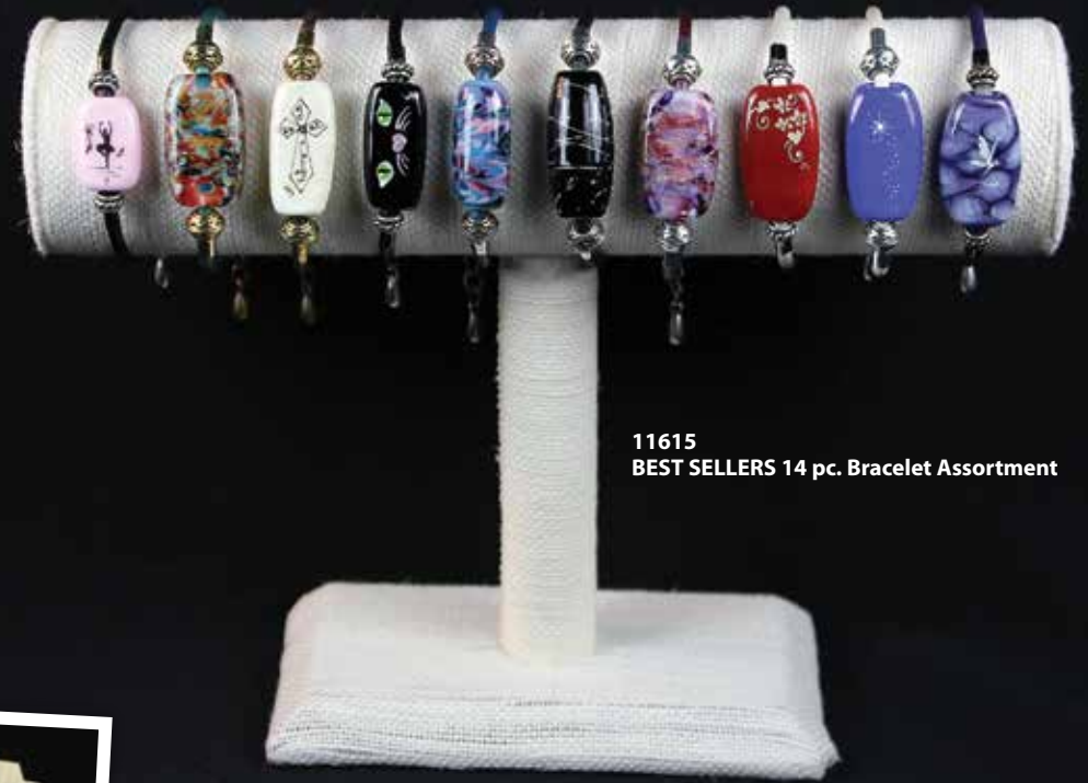
11615 BEST SELLERS 14 pc. Bracelet Assortment