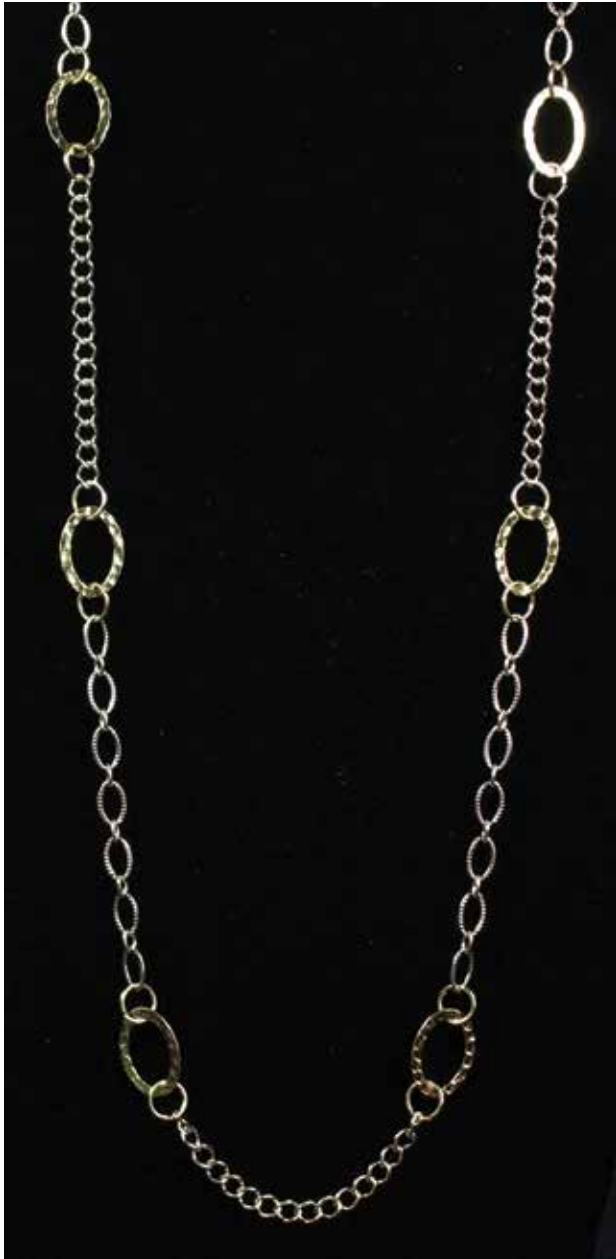
11580 $49.50 Golden Rings Necklace (32")

This beautiful necklace is light and shimmery... lovely for your Spring and Summer fashions. Perfect for layering with any of our other gold plated pendant necklaces. Necklace is 32" and is gold plated brass.