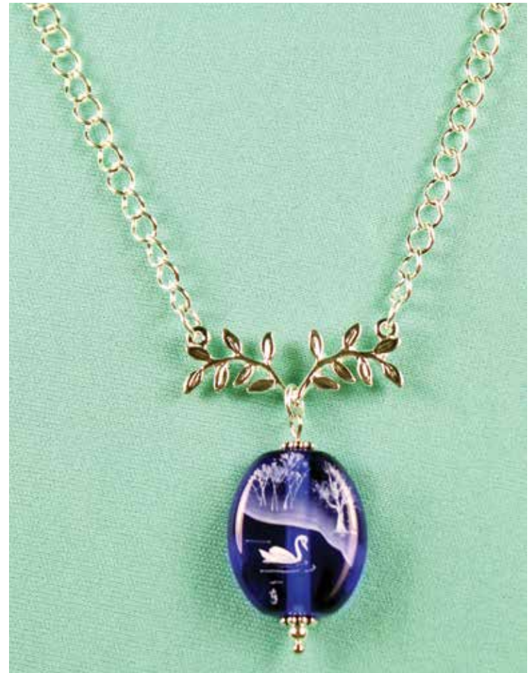
11584 $75.00 Swan Lake Necklace (19")

All chains and necklaces featured in this brochure have a hypoallergenic and tarnish resistant coating. Measurements shown are for the chains only. Sizes may vary for pendants and accents and those are provided in each description.