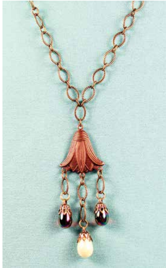
11588 $69.50 Lotus Blossom Necklace (26")

An antique brass Lotus Blossom holds two Ruby Carnival Glass drops and one Ivory Carnival Glass drop (2 1/2") to create a stunning fashion statement!