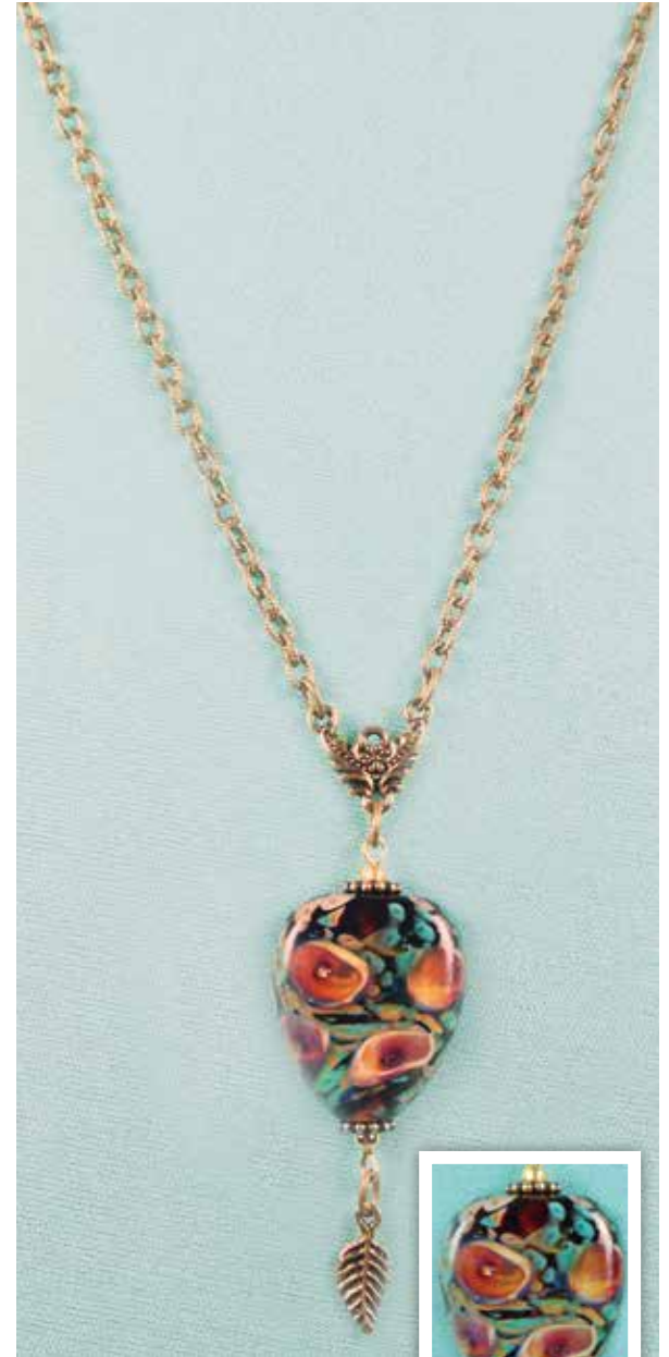
11597 24" or 11576 29" $79.50 each Cavern's Edge Necklace

Delicate striations flow through the ivory glass as the bead maker applies layer upon layer to build this lovely bead. The floral design, by Truda Mendenhall, reminded her of a favorite work of art in her grandmother's home. Available on a 24" or 32" antique brass chain. Pendant, with accent pieces, is 2 5 / 8 " long.