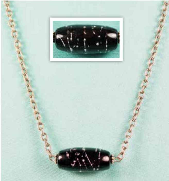
11577 $69.50 Broadway Necklace (19")

This made in USA antique pewter finish necklace is adorned with our Broadway pendant. The velvety black glass canvas is covered with pure silver threads and encased in clear glass. Perfect for everyday or a special night on the town.