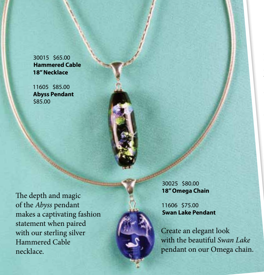
30015 $65.00 Hammered Cable 18" Necklace