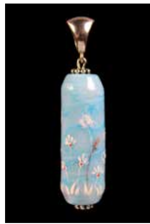
11601 $79.50 Springtime Dandelions