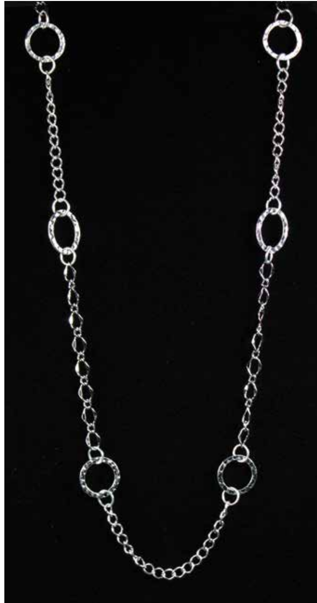
11553 $49.50 Silver Rings Necklace (32")

Our Evangeline Bead is made of reactive glass frit with colors ranging from green, turquoise, creamy yellow, and purple. Our Chocolate glass drop completes the look on this antique brass necklace. No two are alike!