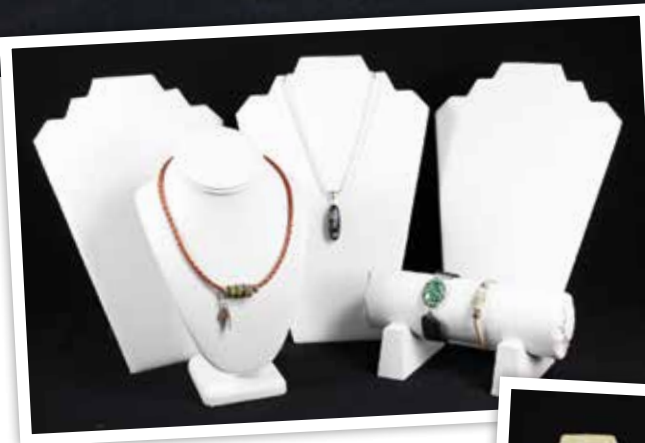
11537 5 pc. White Suede Display Set Included in this set are four necklace forms and one bracelet holder (jewelry not included).

Use these forms to create beautiful displays of Fenton finished jewelry.