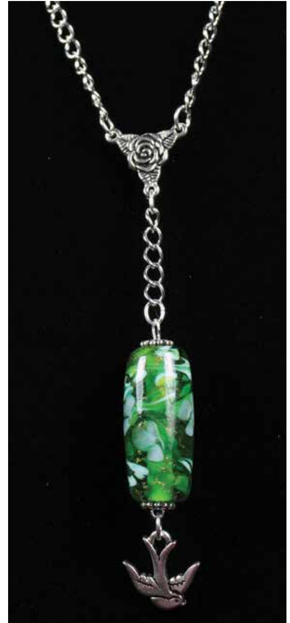
11585 $79.50 Secret Garden Necklace (26")

Magic emerges as unique colors pull together to form a rich tapestry. The glass reacts to create new colors wherever they touch! Hot glass is swirled into shifting, moving color to create the lovely Indian Summer pendant. As a result, no two will be identical! This necklace has a tan leather cord with a 2" extender chain.