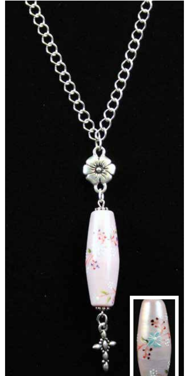
11582 $69.50 Spiral Garden Necklace (26")

Our 3 1/4" Spiral Garden pendant, with floral and cross charm accents, complements this shimmering silver plated necklace. Truda was inspired by front porch columns adorned with climbing, entwined flowers. Her design spirals around the pendant for a beautiful look.