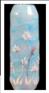
11583 $69.50 Springtime Dandelions Necklace (26")

Recall happy memories of blowing dandelions when you wear our lovely Springtime Dandelions 3" pendant. Floral and dragonfly charm accents complete this 26" silver plated necklace.