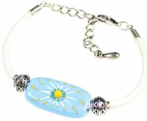
11564 Sundance $49.50

Try this tip for fastening your bracelet: Lay the chain on your palm and hold the end with your last two fingers. Wrap the bracelet around your wrist, then hook the clasp on to the chain!