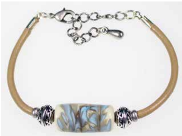
11567 Walk on the Beach $49.50