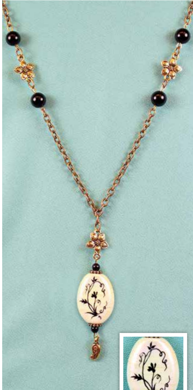
11596 24" or 11575 32" $89.50 each Ebony Garden Necklace

Vasa Murrhina means "vessel of gems." So true in this vibrant purple glass infused with touches of green and goldstone. The Pendant, Black Carnival glass drop and Swarovski accents (3" total) are ideal for this antique brass necklace. Available on a 24" or 32" chain.