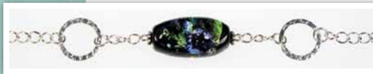
11587 $59.50 Abyss Bracelet (8" Adjustable)

An antique brass Lotus Blossom holds two Ruby Carnival Glass drops and one Ivory Carnival Glass drop (2 1/2") to create a stunning fashion statement!