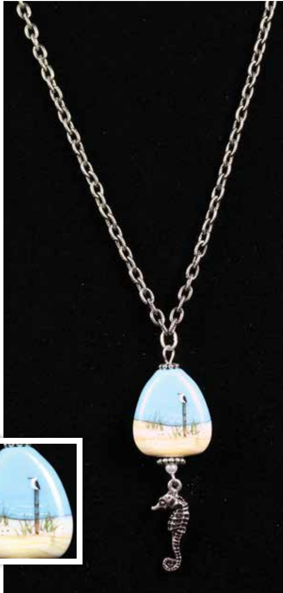
11600 24" or 11578 29" $75.00 Beach Horizon Necklace

A great keepsake to recall summer memories! Our Beach Horizon pendant features ivory glass (sand) and turquoise glass (ocean). Truda's beach scene reminded her of when her father would watch the gulls along the shoreline. The antique pewter finish necklace also has a petite seahorse charm and pearl accent (2 3 / 8 " long with pendant).