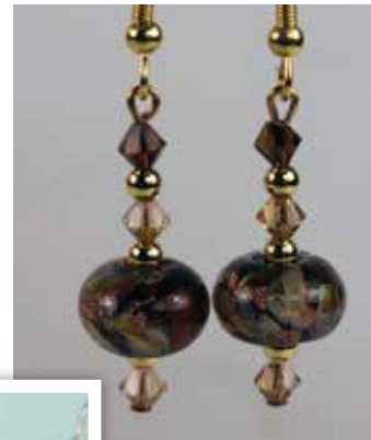
11609 $45.00 Kalico Kitty Earrings

American artistry and "purrfect" style . . . Kalico Kitty necklace and gold plated earrings!