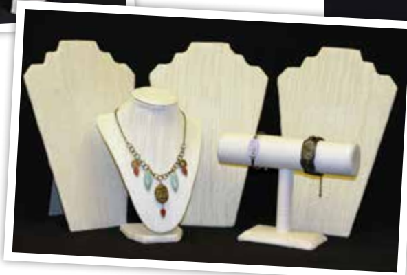
11536 5 pc. Linen Display Set Included in this set are four necklace forms and one bracelet holder (jewelry not included).

Use these forms to create beautiful displays of Fenton finished jewelry.