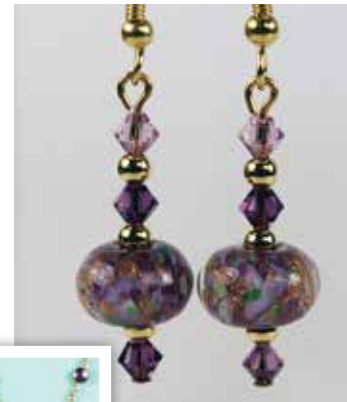
11610 $45.00 Lavender 'n Lilacs Earrings

American artistry and "purrfect" style . . . Kalico Kitty necklace and gold plated earrings!