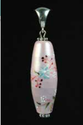
11603 $79.50 Spiral Garden