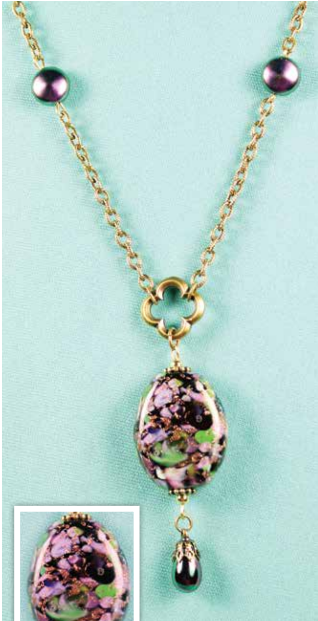
11595 24" or 11574 32" $89.50 each African Violet Necklace

Vasa Murrhina means "vessel of gems." So true in this vibrant purple glass infused with touches of green and goldstone. The Pendant, Black Carnival glass drop and Swarovski accents (3" total) are ideal for this antique brass necklace. Available on a 24" or 32" chain.