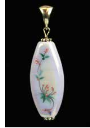
11608 $75.00 Lovely Jasmine