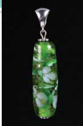
11604 $75.00 Secret Garden