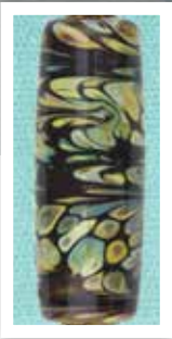
11552 $75.00 Evangeline Necklace (36")

Our Evangeline Bead is made of reactive glass frit with colors ranging from green, turquoise, creamy yellow, and purple. Our Chocolate glass drop completes the look on this antique brass necklace. No two are alike!