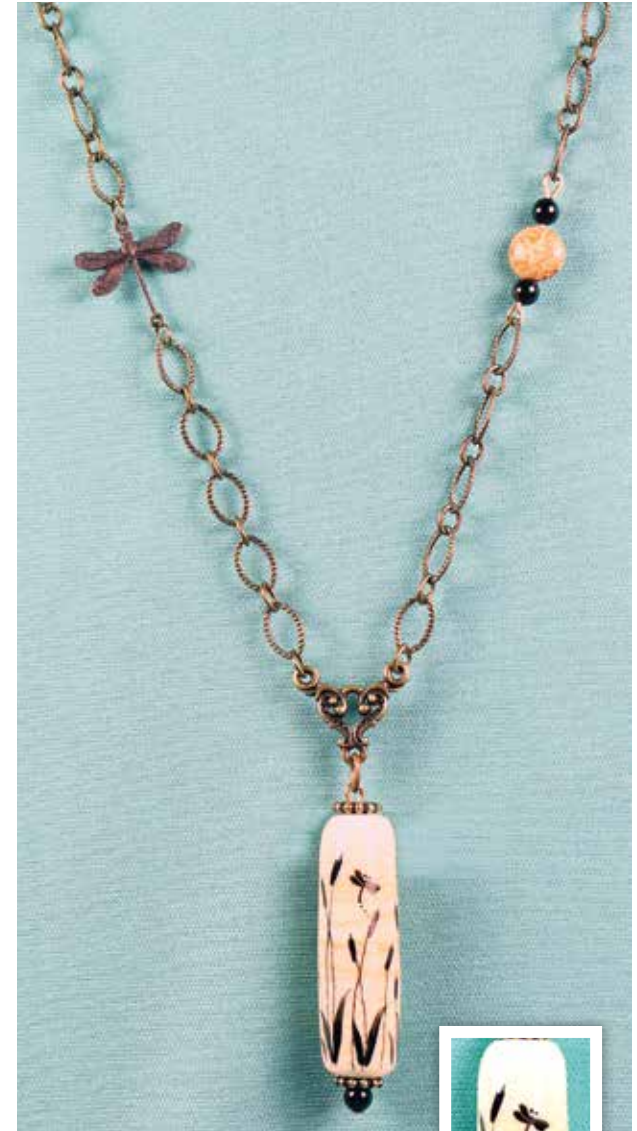
11579 $89.50 Cattails and Dragonflies Necklace (32")

A great keepsake to recall summer memories! Our Beach Horizon pendant features ivory glass (sand) and turquoise glass (ocean). Truda's beach scene reminded her of when her father would watch the gulls along the shoreline. The antique pewter finish necklace also has a petite seahorse charm and pearl accent (2 3 / 8 " long with pendant).