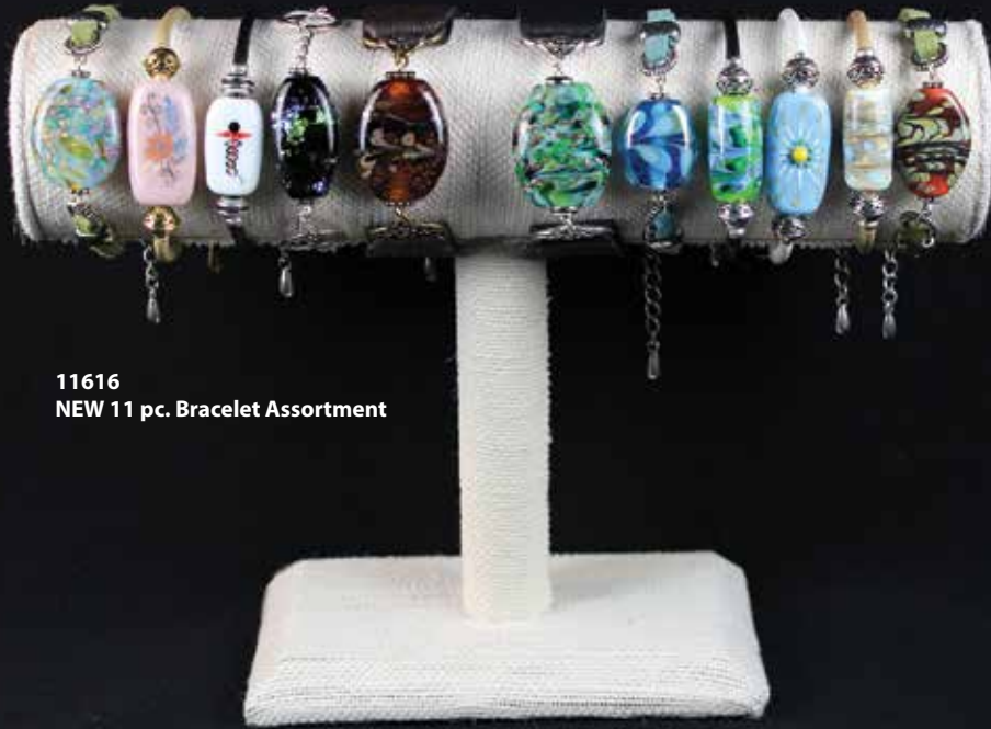
11616 NEW 11 pc. Bracelet Assortment

See pages 3-5 for more information on each bracelet. Included in this assortment are the following bracelets: 11569 Desert Song , 11565 Hope , 11566 Rx of Care , 11587 Abyss , 11560 Kalico Kitty , 11562 Tranquil Pond , 11571 Iridescent Petals , 11568 Meraki , 11564 Sundance , 11567 Walk on the Beach , and 11572 Coral Woods .