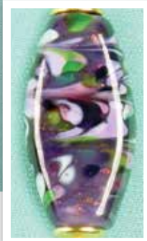
11591 $79.50 Suffragette Necklace (29")

The 1 1/4" pendant features deep violet transparent glass accented with glass bits in deep purple, green and white. These colors are then swirled to form a beautiful one-of-a-kind pattern for each necklace that is as unique as the lady who wears it. The symbols and colors used in this necklace were also used in Suffragette jewelry of the late 19th and early 20th century.