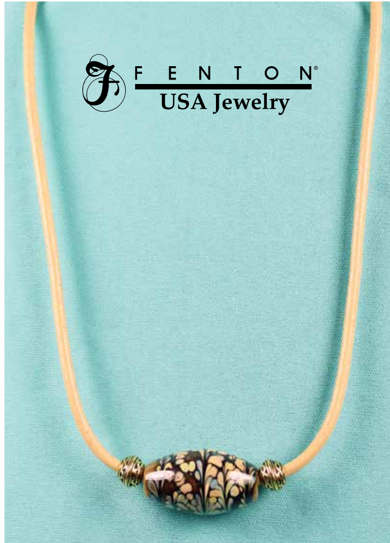
11589 $69.50 Indian Summer Necklace (19")

Recall happy memories of blowing dandelions when you wear our lovely Springtime Dandelions 3" pendant. Floral and dragonfly charm accents complete this 26" silver plated necklace.