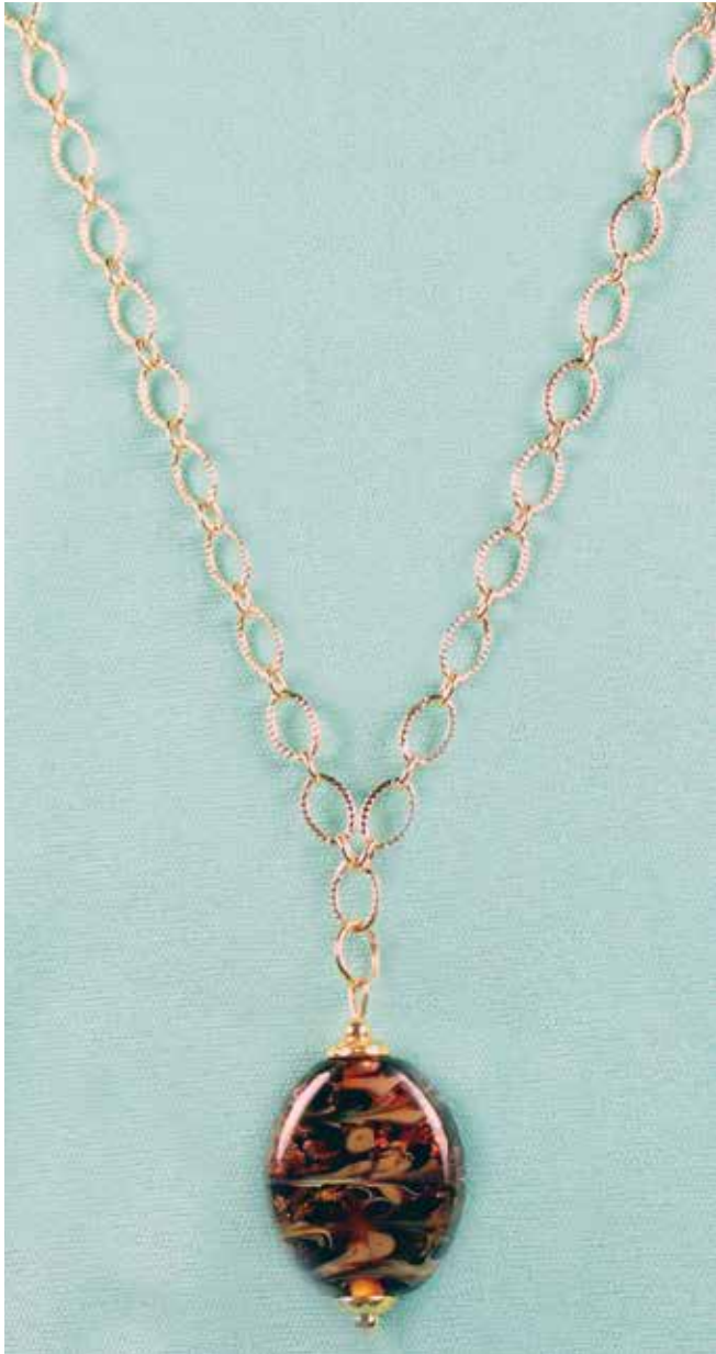
11598 24" or 11590 28" $69.50 each Kalico Kitty Necklace

This delicate gold plated 28" necklace features our 1 7/8" handcrafted Kalico Kitty pendant shimmering with beautiful goldstone! Designed by Jena Lane Blair, this pendant features the signature colors of one of her favorite felines! This necklace is also available in a 24" length.