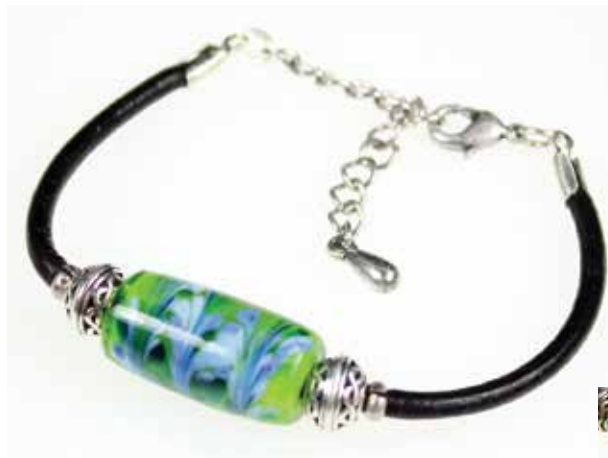
11568 Meraki $49.50