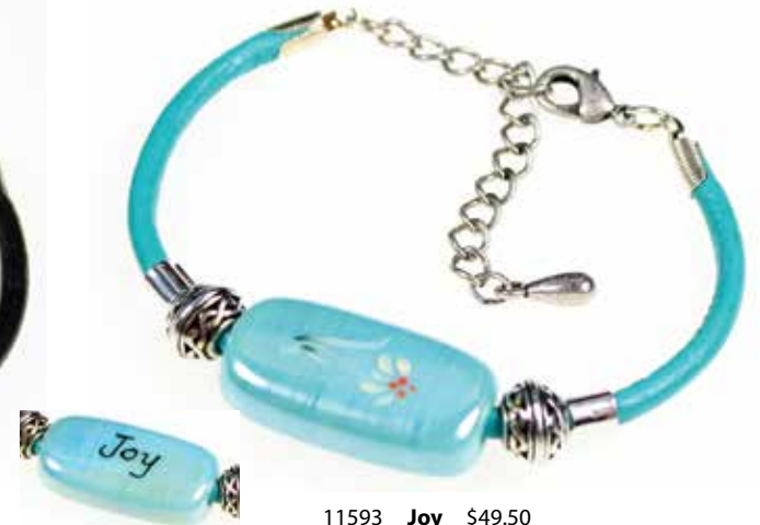
11593 Joy $49.50