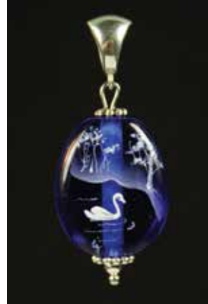
11606 $75.00 Swan Lake